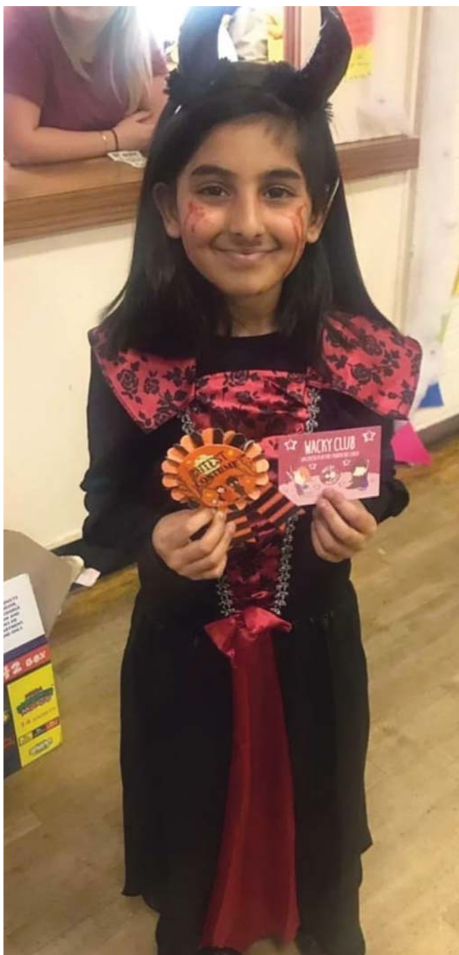
Winning a competition at Deaf Connections