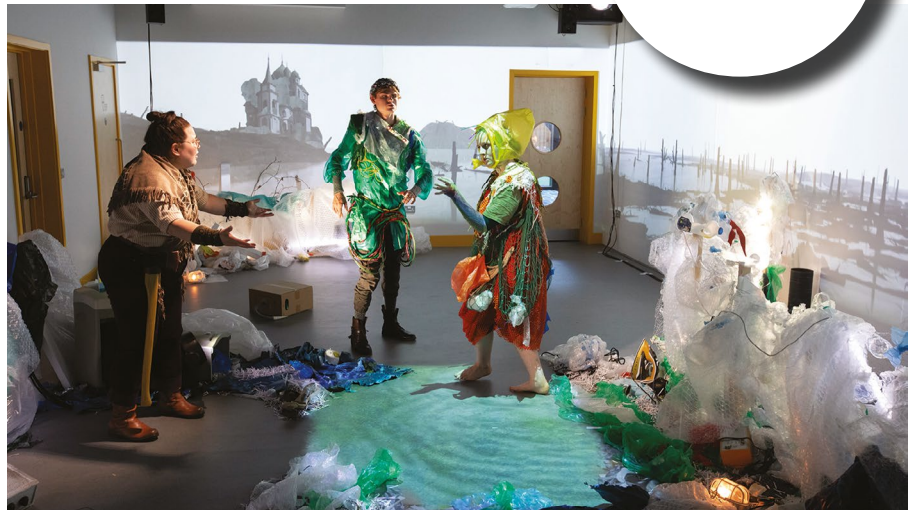
Above: Deaf children designed the swamp area in Polka's opening show, Red