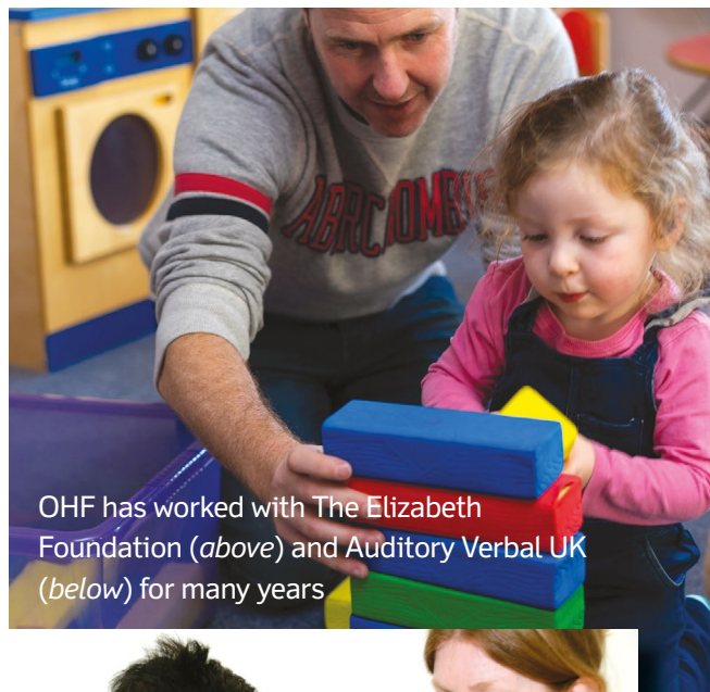
OHF has worked with The Elizabeth Foundation (above) and Auditory Verbal UK (below) for many years