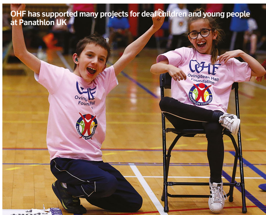
OHF has supported many projects for deaf children and young people at Panathlon UK

Our mission back in 2012 was to help deaf children and young people and build on the legacy of Ovingdean Hall School. We hope that, ten years on, OHF is a fitting tribute to the generations of students, staff, students' families and governors who made the school such a special place to live and learn. We are looking forward to continuing our work into the future and we hope that you will join us for the next stage of the journey!