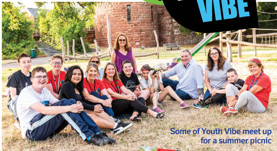
Some of Youth Vibe meet up for a summer picnic

'I started Youth Vibe when I was 12 and now I'm 18 years and a Young Leader,' said one young person. 'Every year I've got more confident, I am friends with other deaf people like me. Youth Vibe has given me loads of different opportunities, last week I did a day placement at ITV studios, it was amazing!'